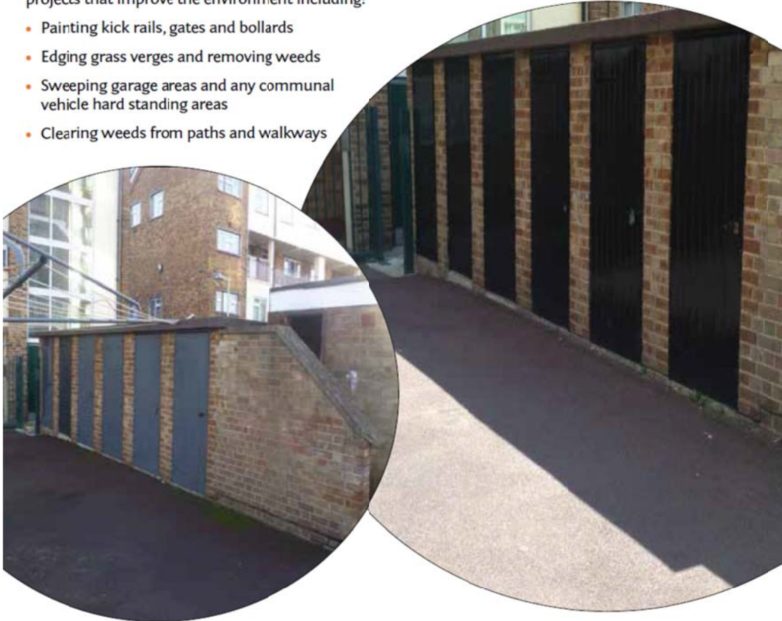
Before (left) and after (right) at Waterloo Estate in Romford

In the next few months you are likely to see them working on other projects across the borough – clear evidence our community is benefitting from Community Payback.